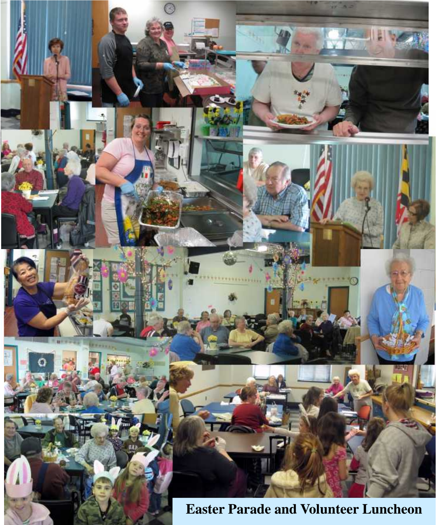
Easter Parade and Volunteer Luncheon