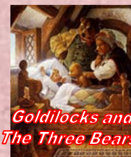
Goldilocks and The Three Bears

Featuring: Each room decorated in the theme of a different storybook. Victorian holiday decorations, Farmhouse tours, Santa visits, Holiday music, Wagon rides, Museum Gift Shop