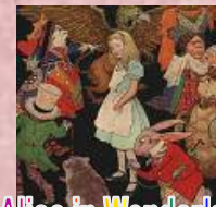
Alice in Wonderland