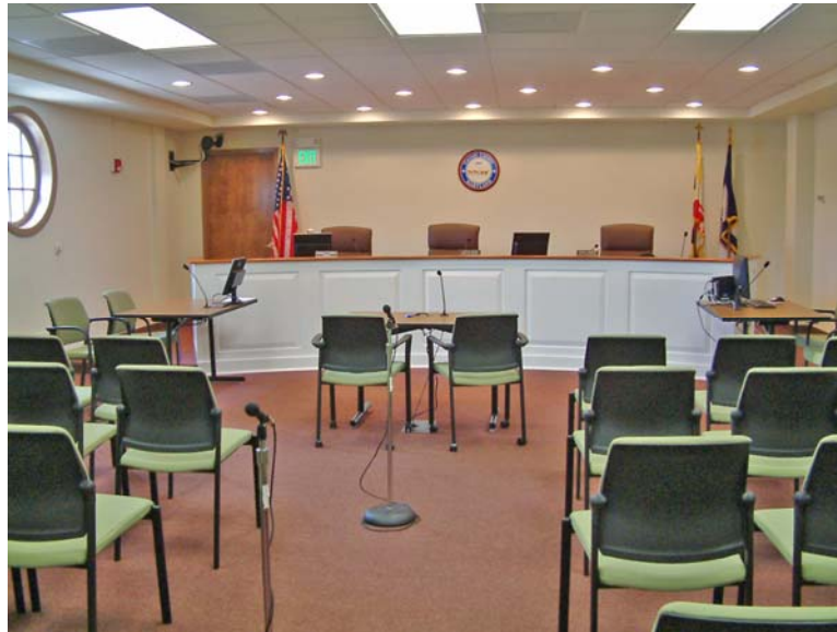
Office of Public Information

The new space was designed to give the public a better view of proceedings. In the previous room, people had to sit along the walls and competed for the few chairs that were not at the presenter's table. Now a small dais makes the Board visible to everyone