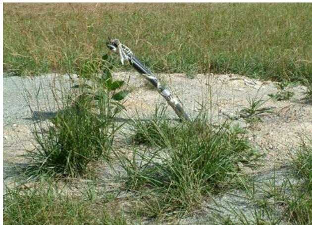
A small pole marks the location of a geothermal test well for the Finksburg library. The project is one part of Carroll's "green" efforts.

The project has been a partnership with Carroll Commu-