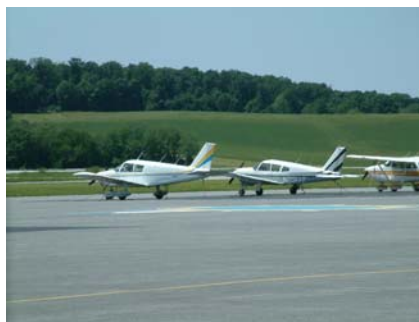
Office of Public Information

After the results of the environmental study are known, the Board of County Commissioners will vote again on whether to proceed with extending the runway. Construction could begin in 2011. A new runway would be operational sometime in 2013. It is expected to create "significant economic and fiscal returns" for the county, according to a study by the Sage Policy Group.