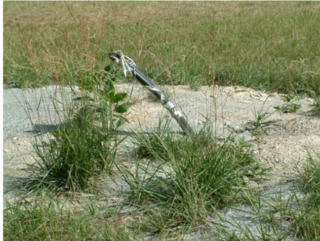
A test well, shown above, was used to determine that a geothermal system can heat and cool the new Finksburg library. At right are engineering plans for a geothermal well.

Such sustainable design features helped Carroll County be named a finalist in the national 2007 Sustainable Communities Award. Win-