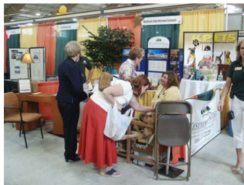
Visitors to the 2007 Seniors on the Go Expo gather information and visit with friends at the Shipley Arena.

The Center for the Study of Aging at McDaniel College will present seminars on the follow-