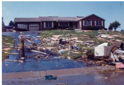
Tornadoes can strike in Carroll County, as seen by this damage in Gamber from a July 1996 twister.

shelters will not allow them to be brought in.