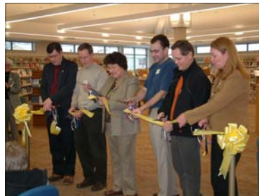
A ribbon is cut to mark the opening of the Taneytown addition (above left and below). Scouts prepare to raise the flag over Finksburg's new library (above right).