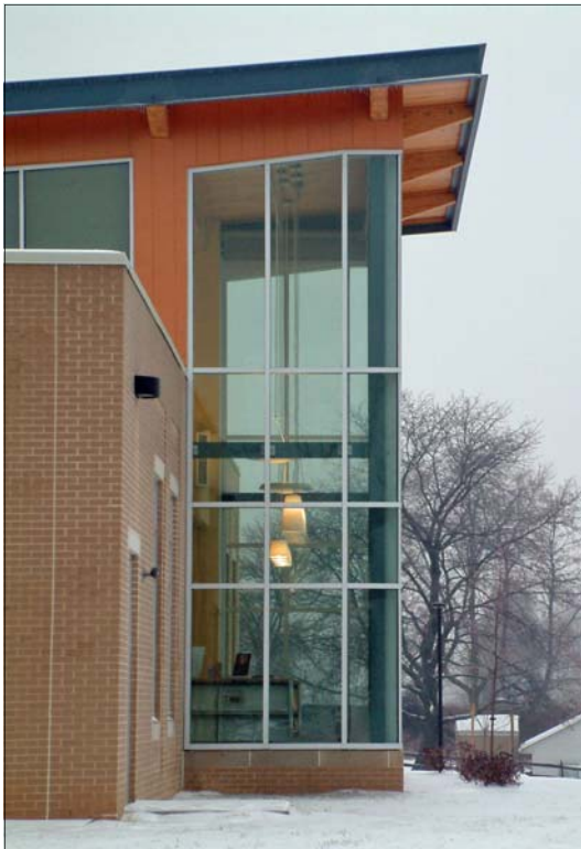
The Finksburg branch (above and below) is considered a "gateway" building for the community.

lighting. The same day that Finksburg opened, the Taneytown branch opened its expanded facility, with more than 5,000 square feet of additional space. That project cost approximately $1.75 million. Both were 100 percent funded by the County.