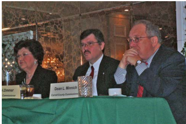
Office of Public Information