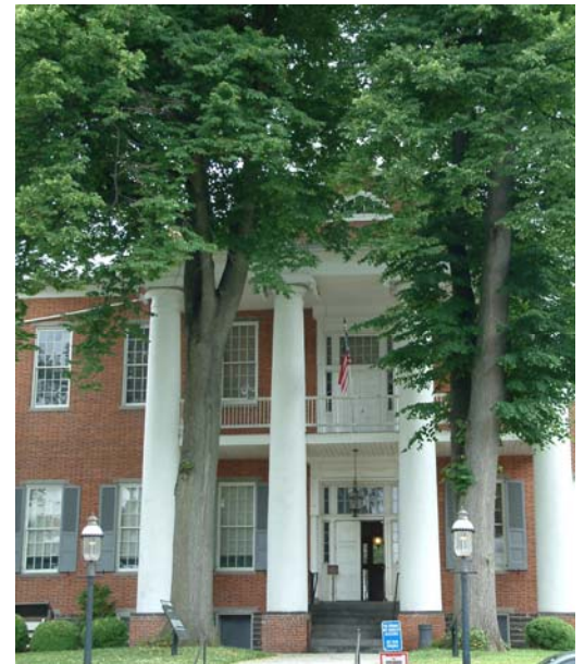
The historic courthouse still houses offices for the Carroll County Circuit Court.