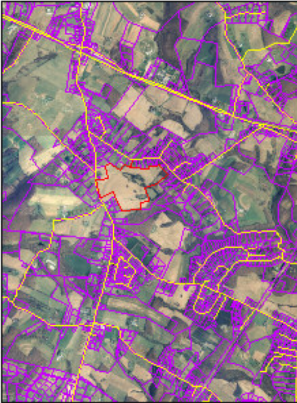
Future Location of Kringold Park, Map 67, Grid 14, Parcel 30